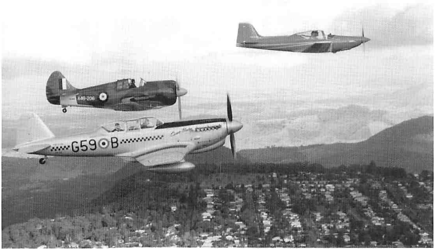
The Air Defense Squadron of the Zuccoli Air Force over Toowoomba, Australia. Tony Chamberlin is in the Fiat in the foreground, Guido Zuccoli is flying the round-engined Boomerang fighter, and Wayne Milburn leads in the Falco. They are actually flying a Vee formation, but the smaller size of the Falco throws the proportions off.

"A good test of the performance of the Falco (and the engine/prop combination) and a method which Guido uses often, is to dive the aircraft to Vne, level out for a couple of seconds to stabilize, read off the altitude and pull vertical. Read your altitude again at the top when you torque off and note your height gain. For interest's sake, the Pitts gains 1800' (200 hp/fixed pitch Hoffman), the Laser/Stephens Akro — 2300' (200 hp, M.T. constant speed), and the Falco — an amazing 2800' gain, and that is loaded up with a full panel of avionics, too! A word of warning: recovery from an incipient rolling tailslide is not in everyone's capabilities!"