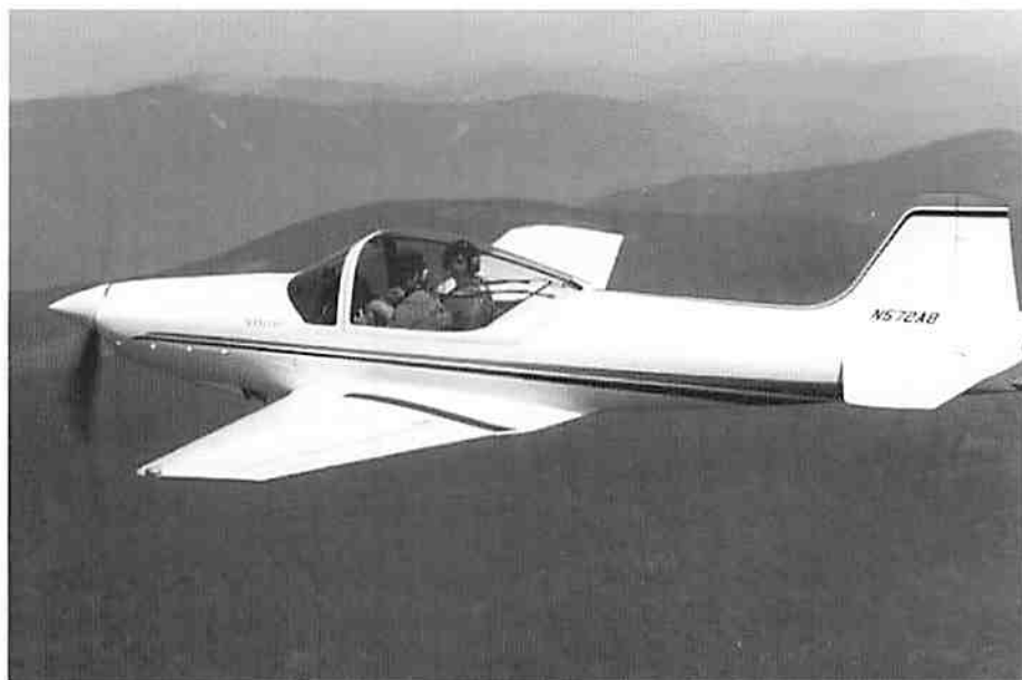
Larry and Ann Black over the Sawtooth Mountains of Idaho.

When I used to build model airplanes, I used a small hand plane made by the